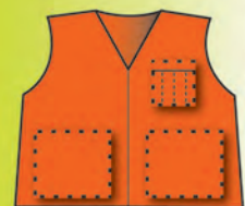
Interior 4 Pockets Include a 4-Division Pen Pocket