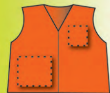
Interior 2 Pockets